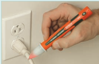
Quickly check for the presence of live wires before testing